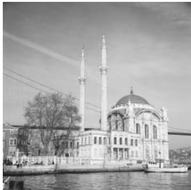
The Ortakoy Mosque with its towering minarets in Istanbul, Turkey.

During the 1920s and 1930s, Atatürk drove through a program of modernization that involved assaults on Islamic institutions and traditions. Education and the courts were taken out of religious hands; pious endowments ( waqf ) were confiscated, Sufism outlawed, religious dress permitted only within the mosque, and Western dress enforced elsewhere. The government abolished the Muslim calendar, made Sunday the day of rest, and replaced Arabic with the Latin alphabet. Women were given legal equality with men. The number of mosques was reduced and the content of sermons supervised. In all, this amounted to the greatest attack on Islam anywhere outside the Soviet Union.